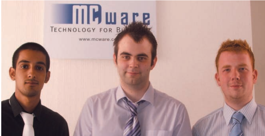
High flying: ITEC Middlesbrough Apprentices